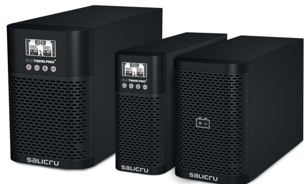
SLC TWIN PRO2