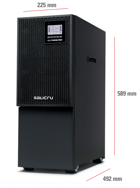
SLC 4000÷10000 TWIN PRO3