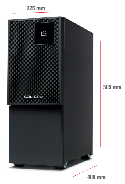
EBM - SLC TWIN PRO3